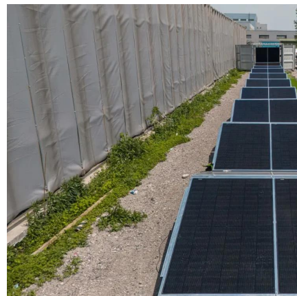
Mass Sine 24/5000 (230V/50Hz) , Sine Wave Inverters

Jun 18, 2014 · From safe and stable lithium batteries to world class inverter technology and solar options, our products help customers power their lives in a clean, efficient, and resource / cost ...